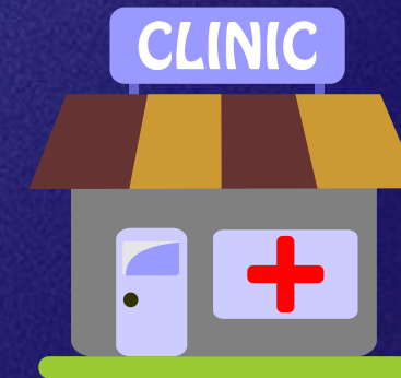
Clinics & Healthcare