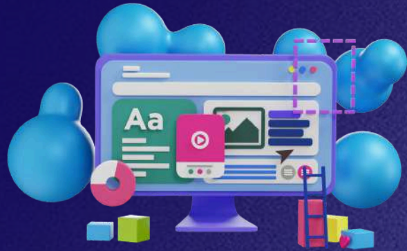
WEBSITE & APP DEVELOPMENT