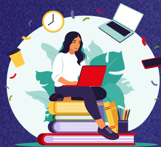
Education & Online Courses