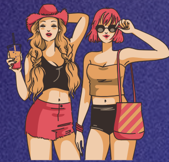
Fashion & Lifestyle