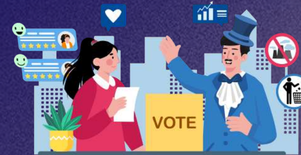
PRODUCT REVIEW CAMPAIGNS