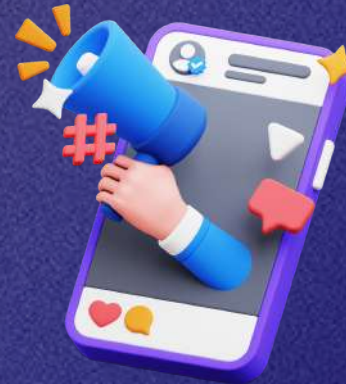
TIKTOK & REELS MARKETING