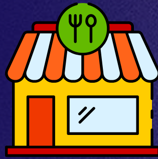
Restaurants & Cafes