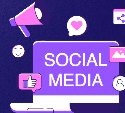
SOCIAL MEDIA MANAGEMENT