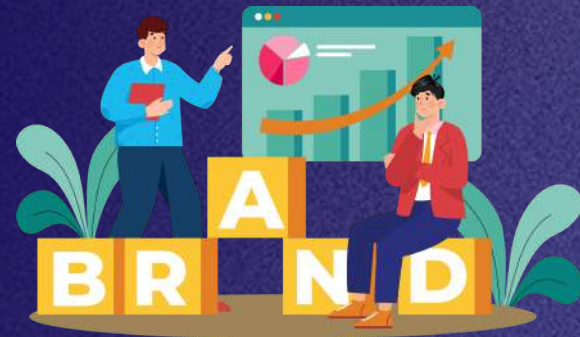
BRANDING & CREATIVE DESIGN