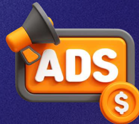
ADS CAMPAIGN MANAGEMENT