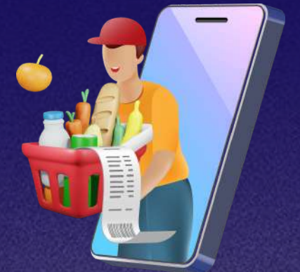
Food Delivery Services