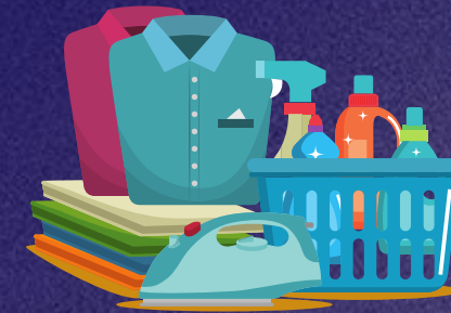
Lifestyle Products & Services