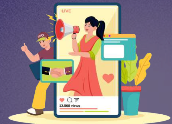
PR & BRAND COLLABORATIONS