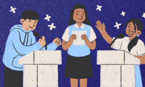
Events & Entertainment