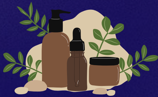
Beauty & Cosmetics